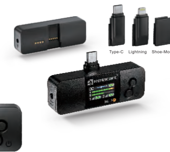
Mi3 Wireless Receiver