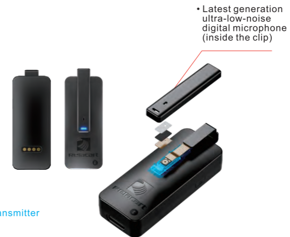
Mi3 Wireless Transmitter